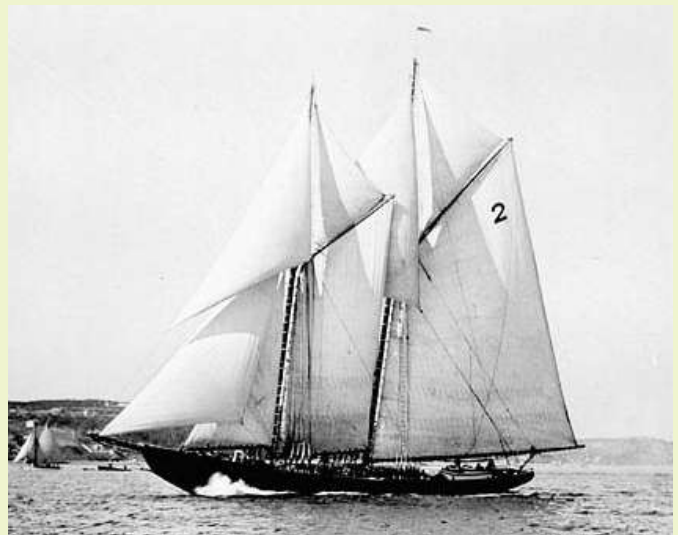
Bluenose sailing in 1921